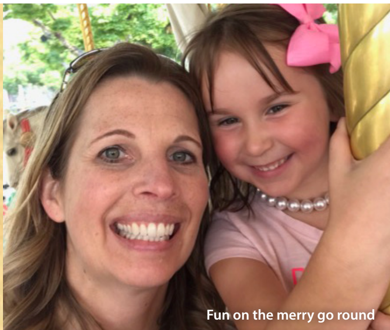
Fun on the merry go round