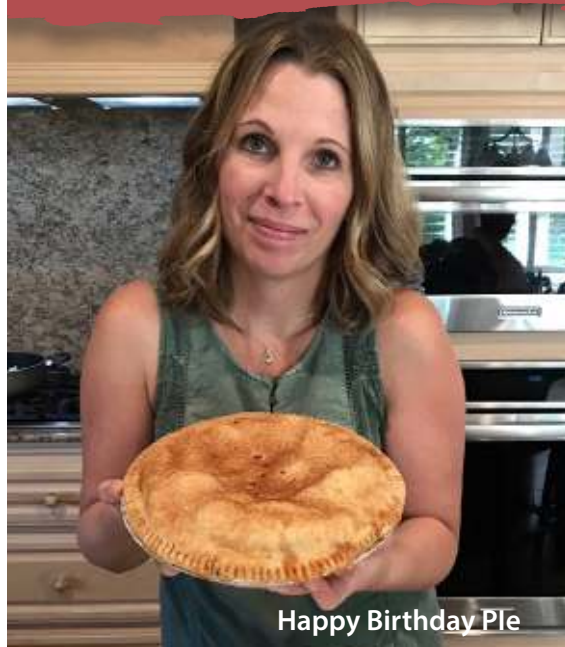
Happy Birthday Pie