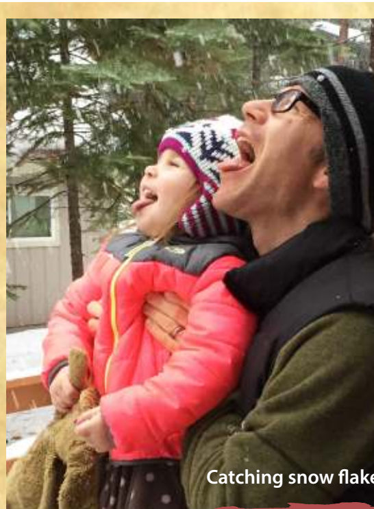
Catching snow flakes