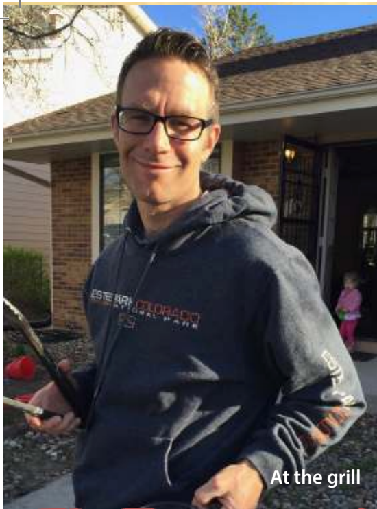
At the grill