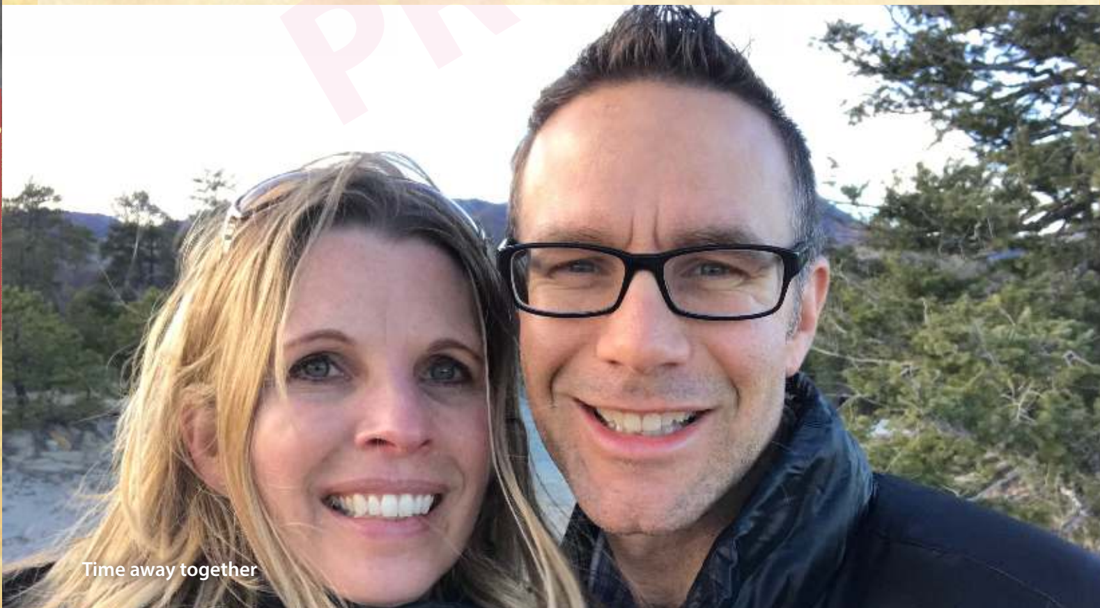
Time away together