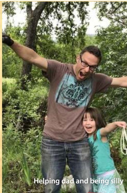
Helping dad and being silly