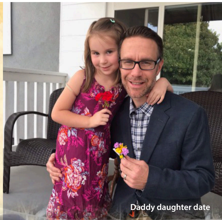
Daddy daughter date