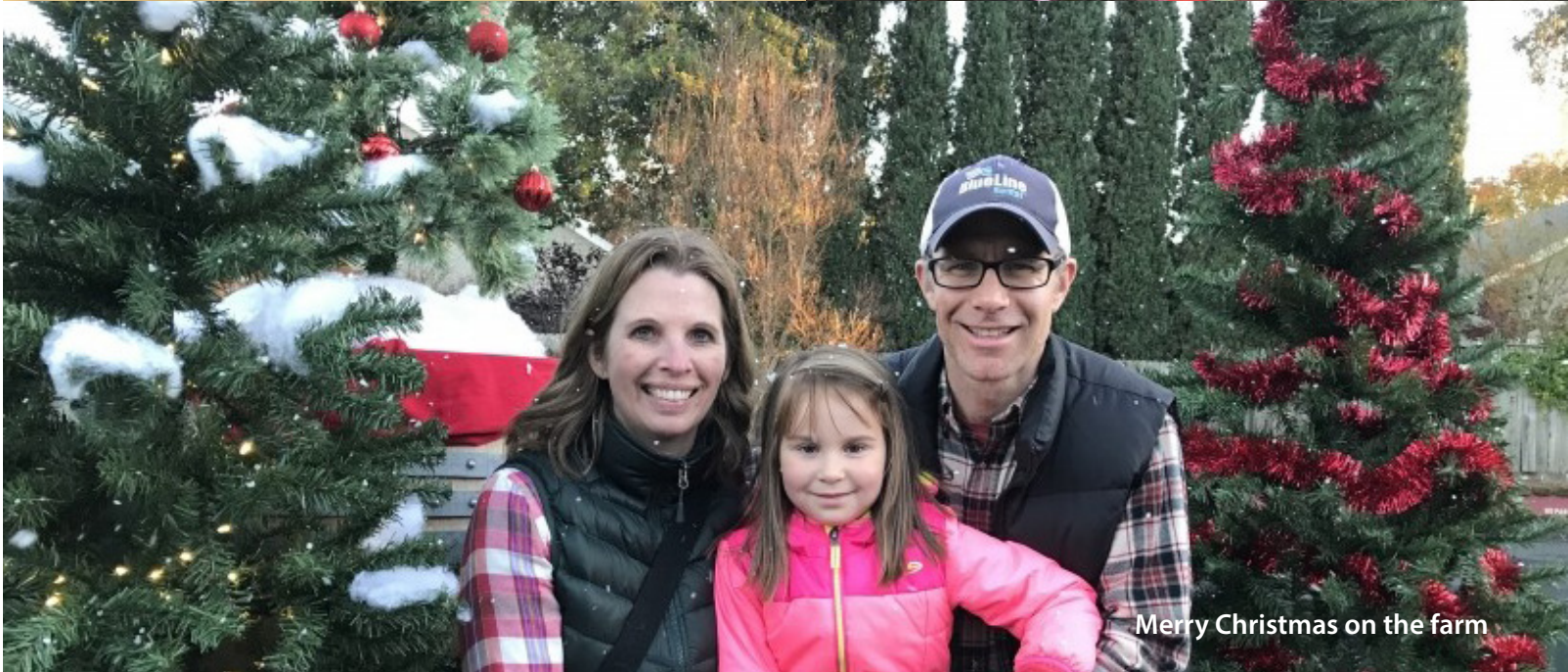
Merry Christmas on the farm