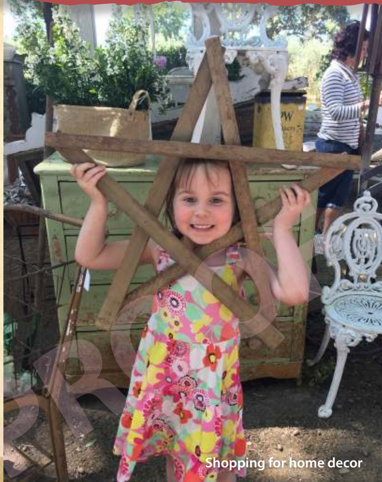
Shopping for home decor