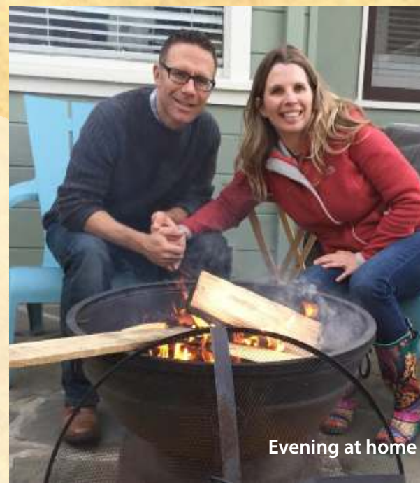
Evening at home