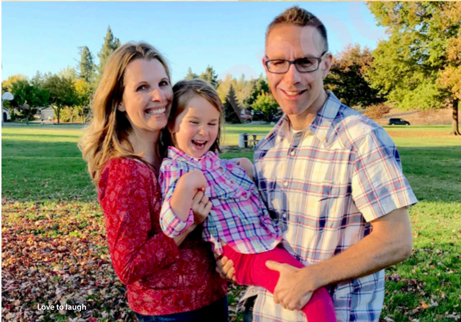
Love to laugh