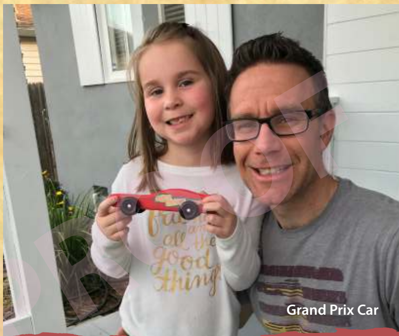
Grand Prix Car