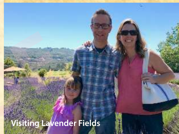
Visiting Lavender Fields

"The three of us cannot wait to share our lives with another child! "