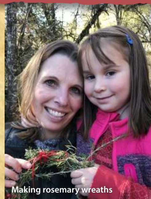
Making rosemary wreaths