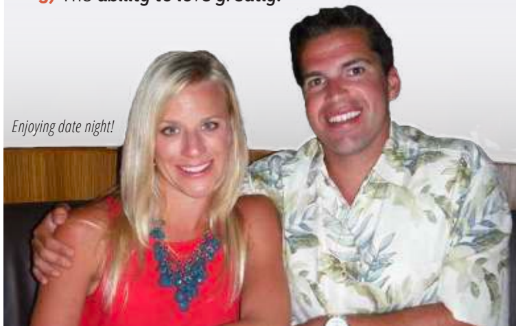
Enjoying date night!