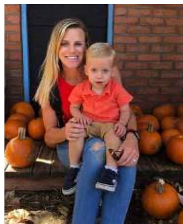
We love pumpkin carving with Mom!