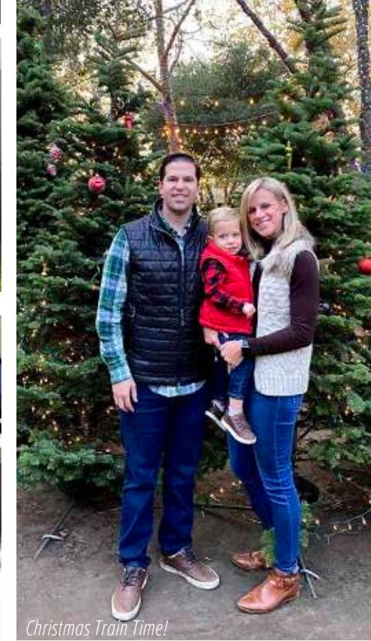
Christmas Train Time!