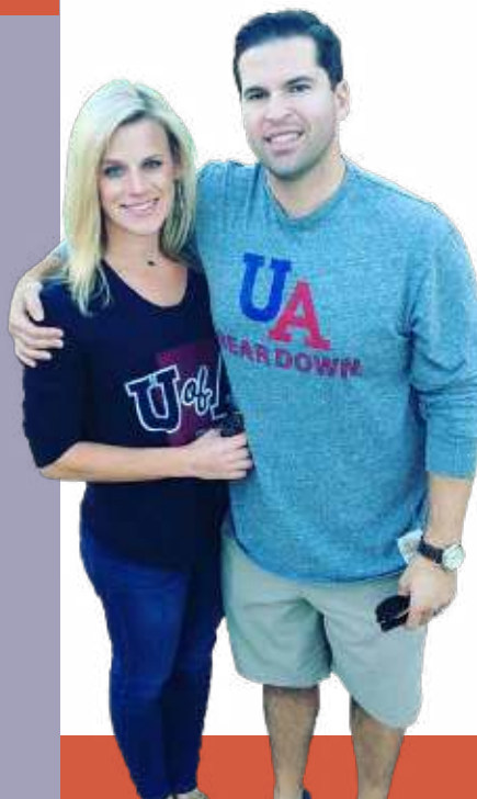
Rooting on our favorite team