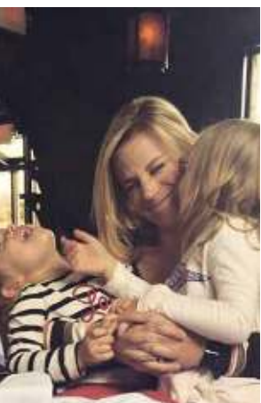
Super silly with my nieces!