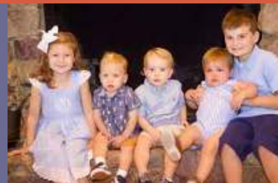
Picnic time with big cousins