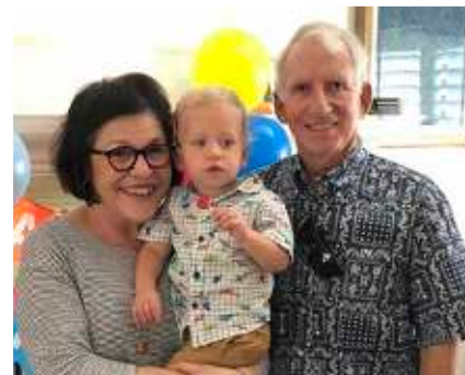
Celebrations are sweeter with Nonna and Bops