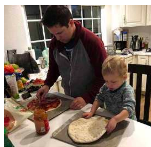
Exploring our Italian Heritage