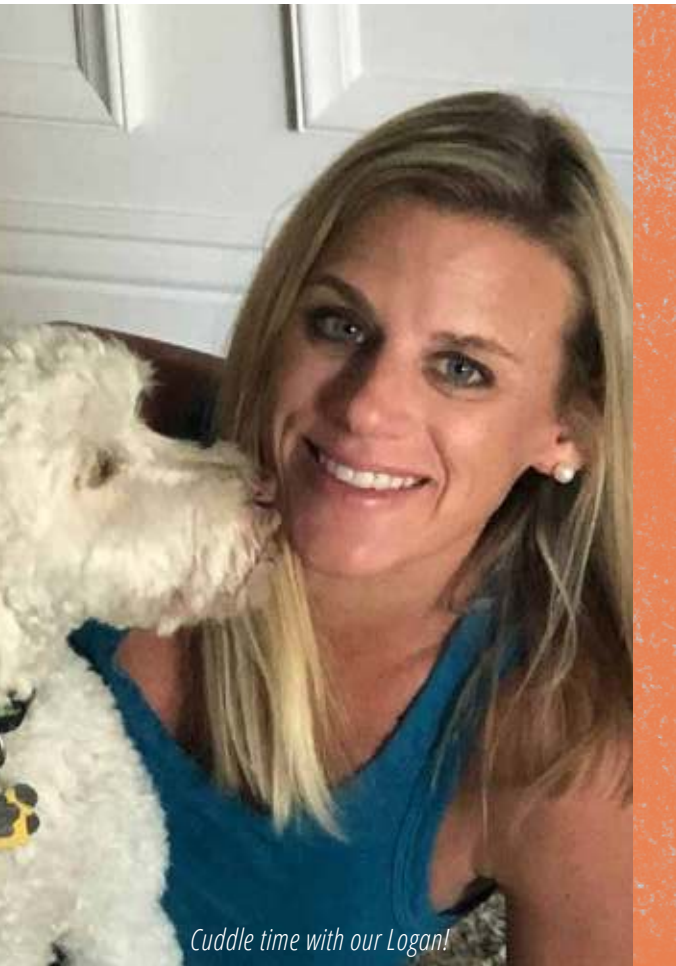
Cuddle time with our Logan!