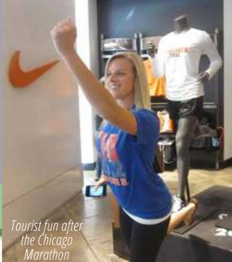
Tourist fun after the Chicago Marathon