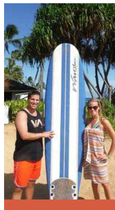
Taking in the scenery while paddle boarding!

We want to encourage our children to play outside, to explore and to find activities that inspire them. But most importantly, to enjoy quality time with family! We envision a future of magical Christmas mornings, family vacations, beach camping trips, first airplane rides, sporting events and creating new family traditions.