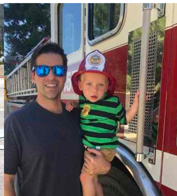
Fire Station to visit our heroes