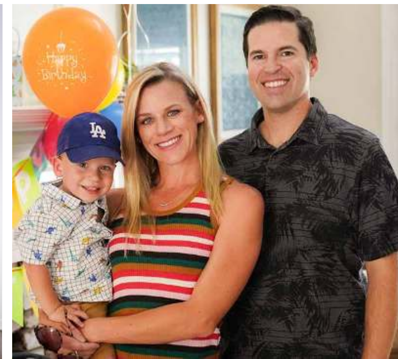
Celebrating birthdays as a family